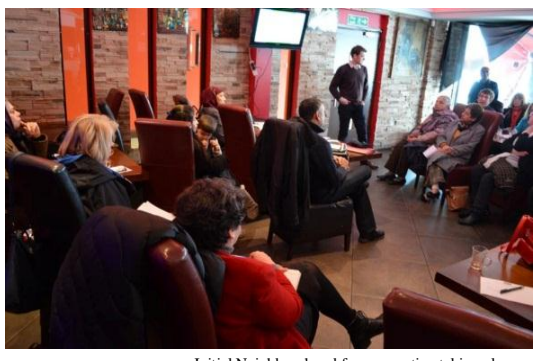
Initial Neighbourhood forum meeting taking place on Saturday, 16 March 2013 kindly hosted by Maya Restaurant

Sunday, 28 April 2013 from 12 o'clock (mid-day) to 5 pm Saturday, 25 May 2013 from 12 o'clock (mid-day) to 5 pm